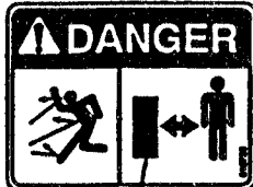
Label Danger Flying