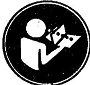
Label Read Owner's Manual