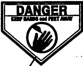
Label Danger Keep Hands and Feet Away